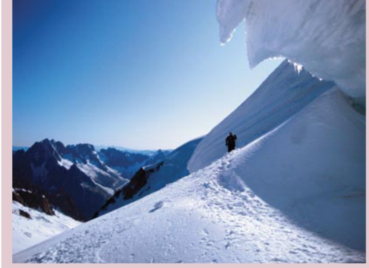
The 2012 avalanche site - cornices teeter above climbers on Mt Blanc tu Tacul - three monts route. Below: Aiguille du Midi ridge - start of the route. Bottom: sunrise on the Col du Midi.

The tragedy of their deaths will never be erased for the loved ones these climbers left behind. But on