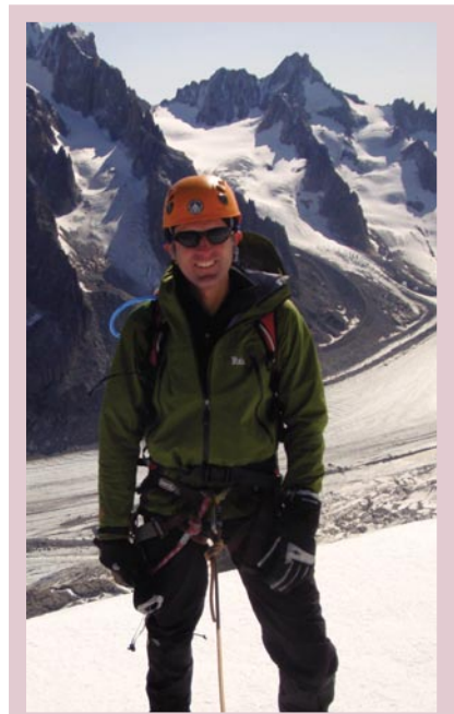
The author above the Argentiere Glacier.

In July one of those seracs finally broke loose, plunging into several climbers on the slope below. After knocking them from their precarious stances, the ice slammed into layers of wind-blown snow, loosely attached to older, harder snow beneath. In a flash, a 150 metre wide crack opened in the snowy face, breaking an enormous